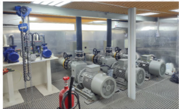
Seawater & Freshwater Pump Room

We understand the critical importance of maintaining operational efficiency and reliability in pump room and pipeline systems. Our maintenance and repair services are designed to ensure the ongoing performance and longevity of pumping infrastructure.