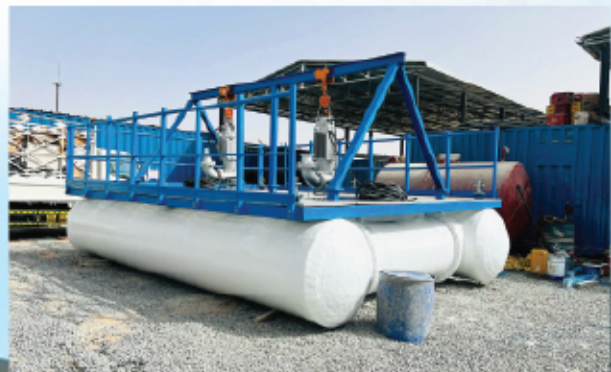
Floating Pump System